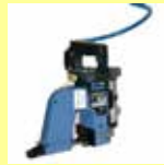
Pneumatic sewing head - 5bar