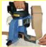
Portable sewing head mod. TAPE