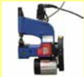
Horizontal portable sewing head