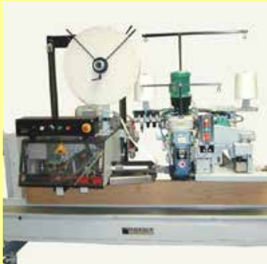
Sewing machine mod. TAPE