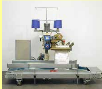
Semiautomatic Sewing machine