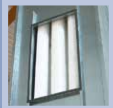
■ Self cleaning filter