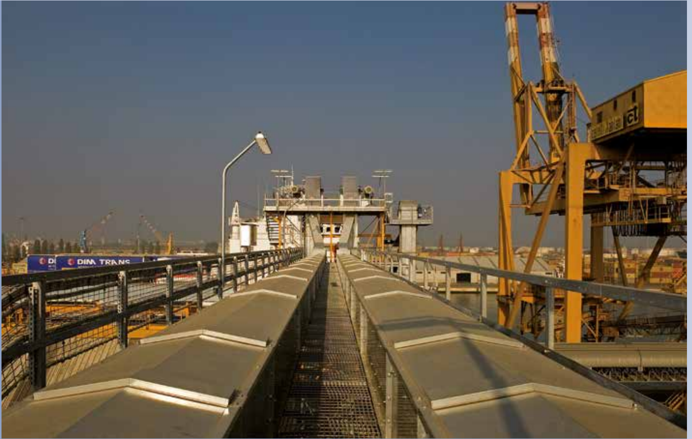
■ Bucket elevator for loading the chain conveyor