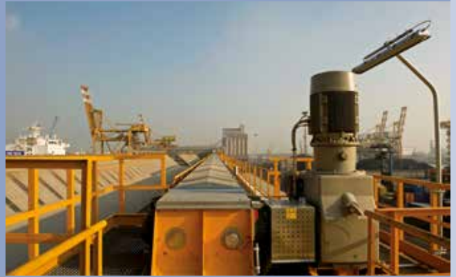
■ Chain conveyor for warehouse loading