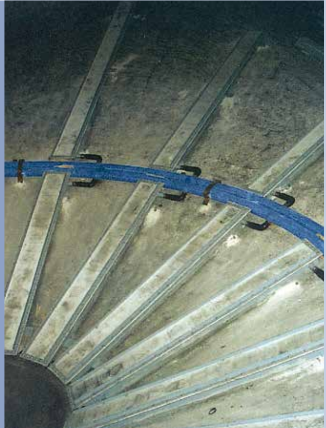
■ Fluidificable ducts for silo cones