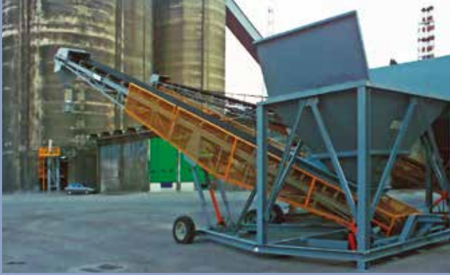
■ Loading Belt for truck - train waggons with hopper and continuous weighing system