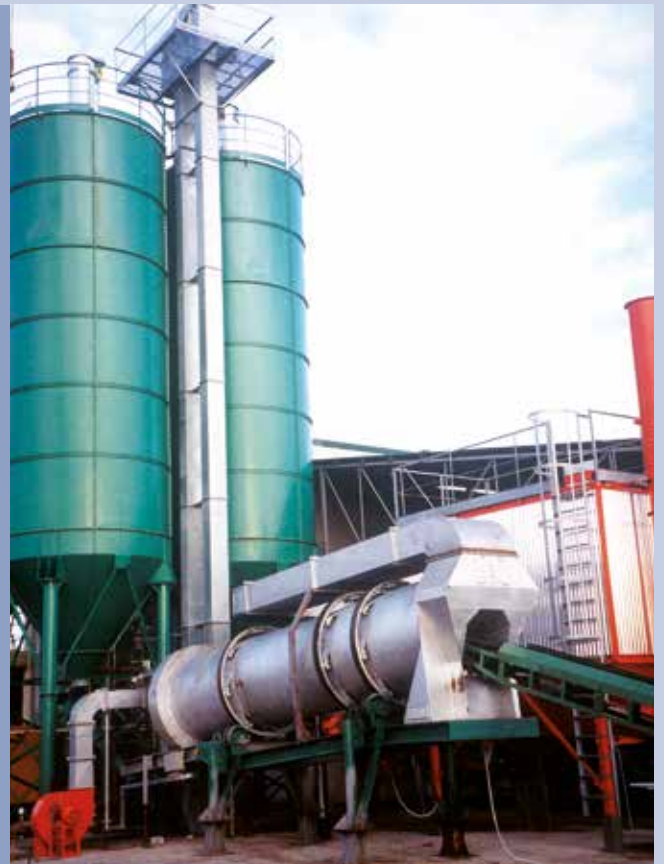
■ Bucket elevators for sand