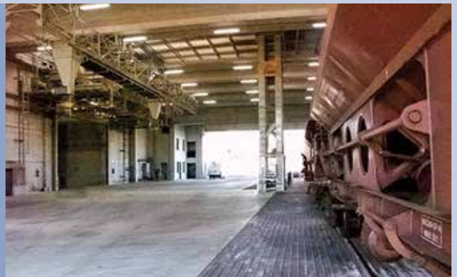
■ Wagons drain system with weighs and attached robotized storage cells