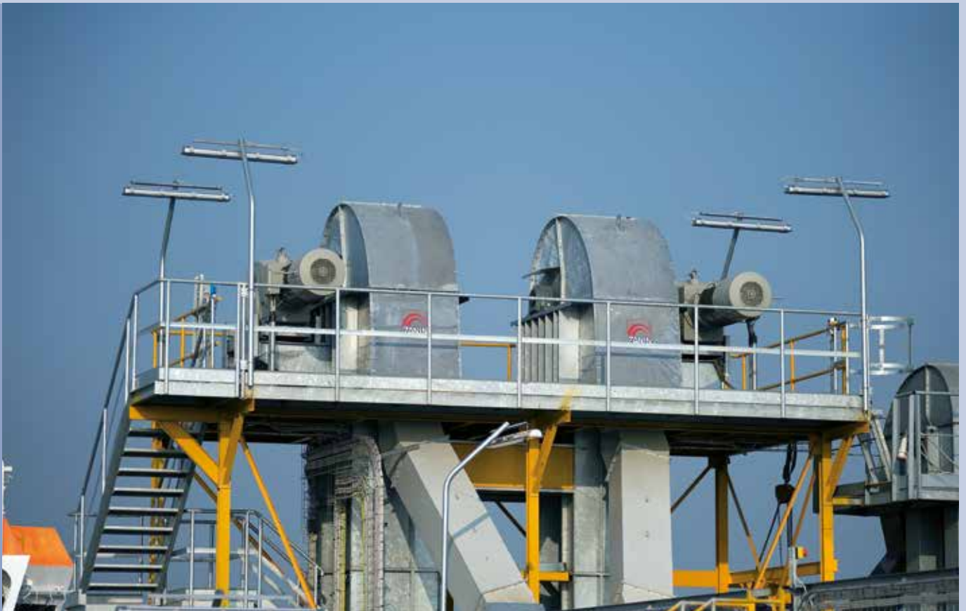
■ Lifting system head group