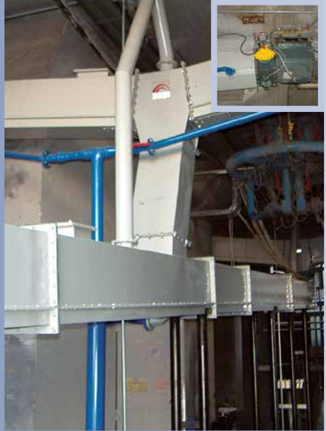
■ Fluidificable ducts for ash-concrete transport