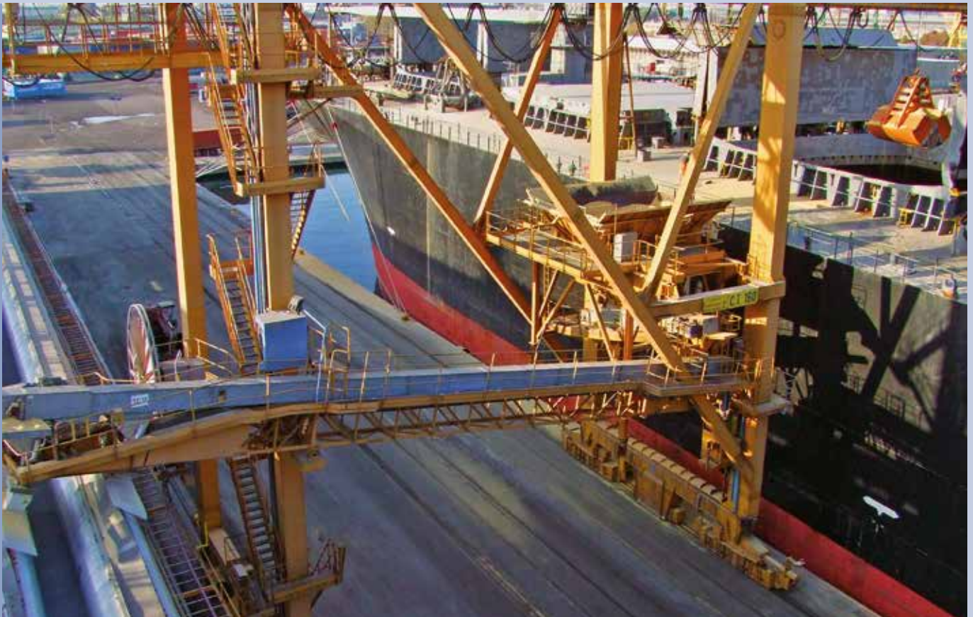
■ Ship to warehouse unloading lines