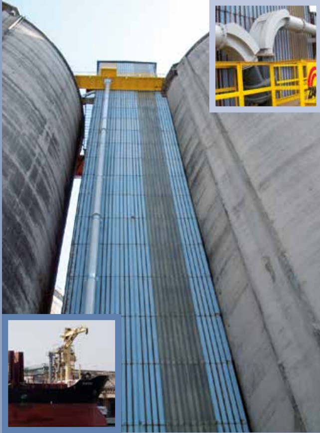
■ Pipeline for pneumatic transport from ship to silo, height 60 meters