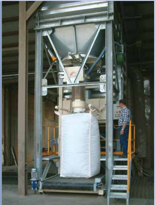
■ Gross weight bagging BIG BAGS