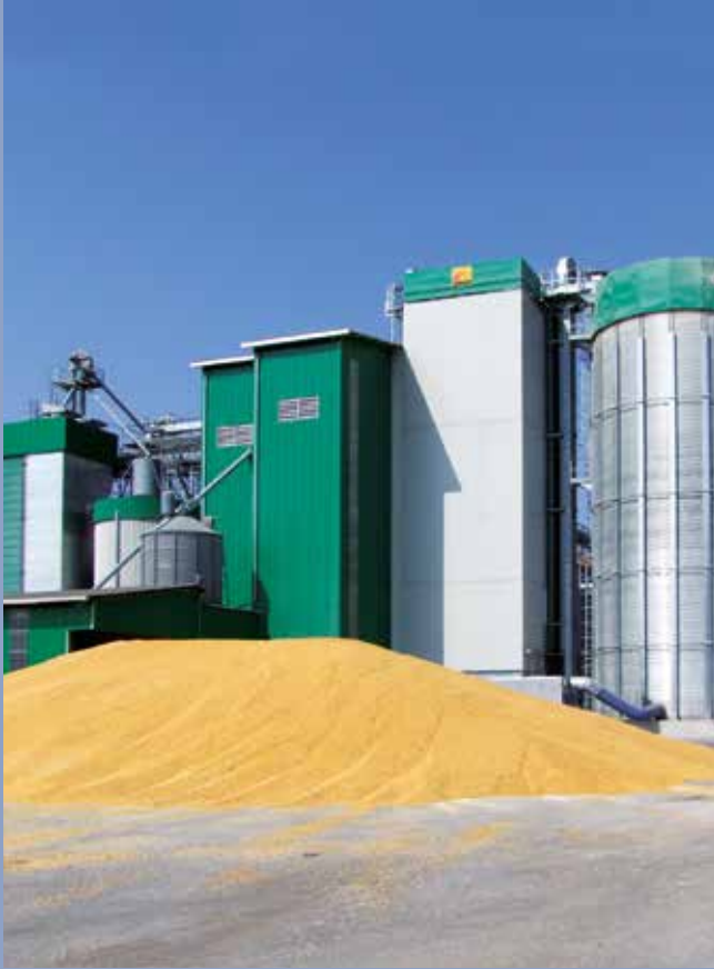
■ Grain Drying plant with CR dryer complete with a slow cooler