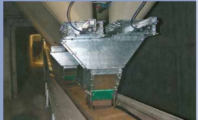
■ Unloading phase from square cells silo