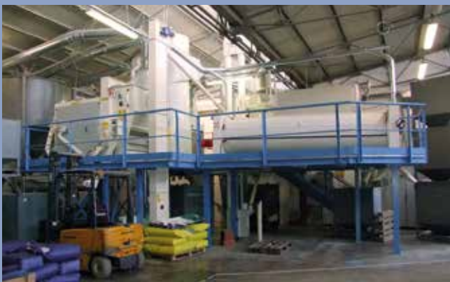
■ Seeds selection system