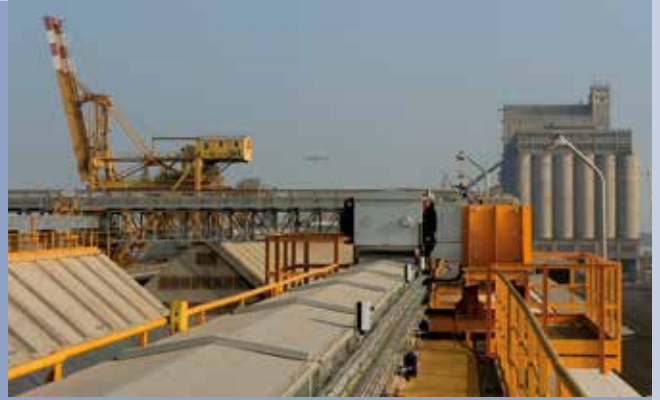
■ Unloading plant