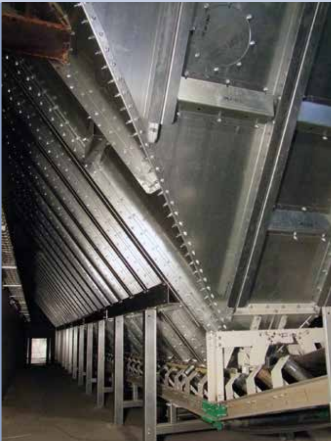
■ Receiving hopper with belt conveyor