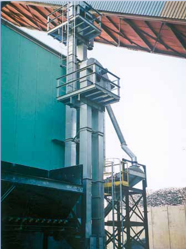
■ Stainless steel elevator with vibrating screen and hopper