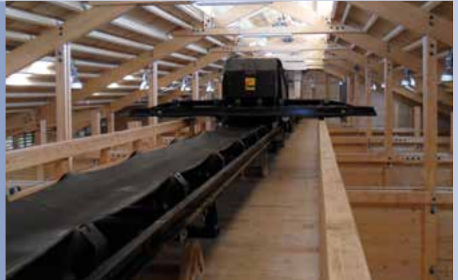
■ Warehouse cells loading system