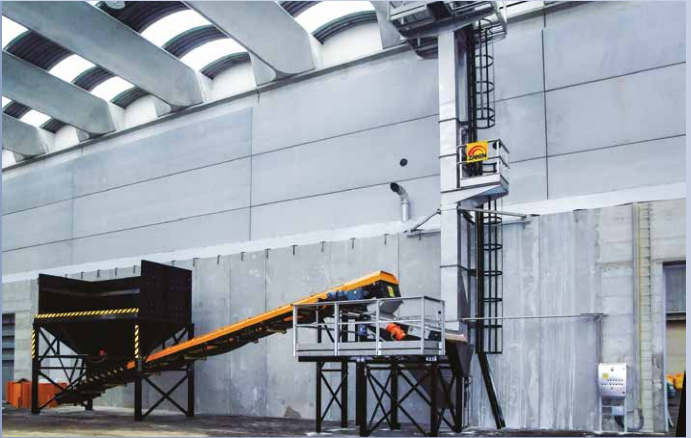
■ Moving, sieving and bagging plant for fertilizers