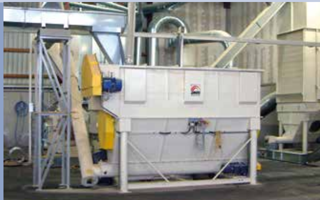
■ Pellet production plant