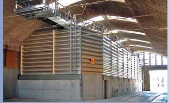
■ Square cells silo