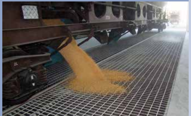
■ Unloading waggons on hopper