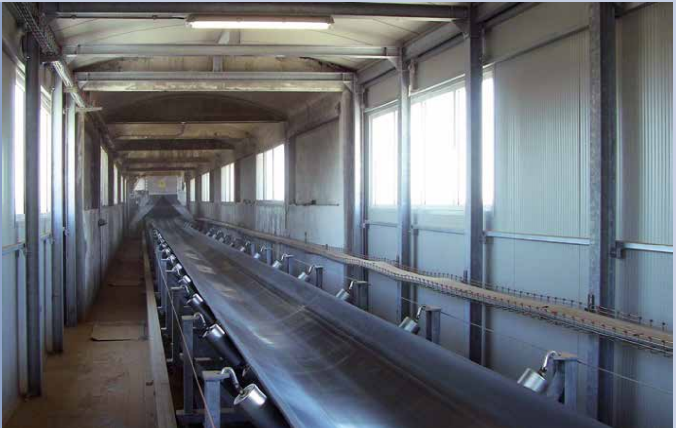
■ Belt conveyor