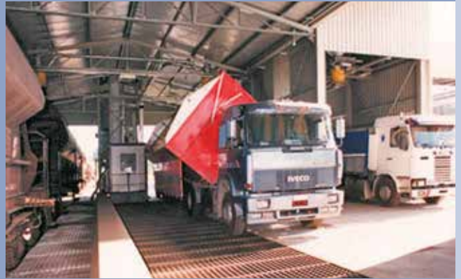
■ Wagons weighing hopper with an attached hopper for trucks with hydraulic tipper