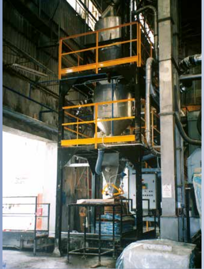
■ BIG BAGS net weight bagging