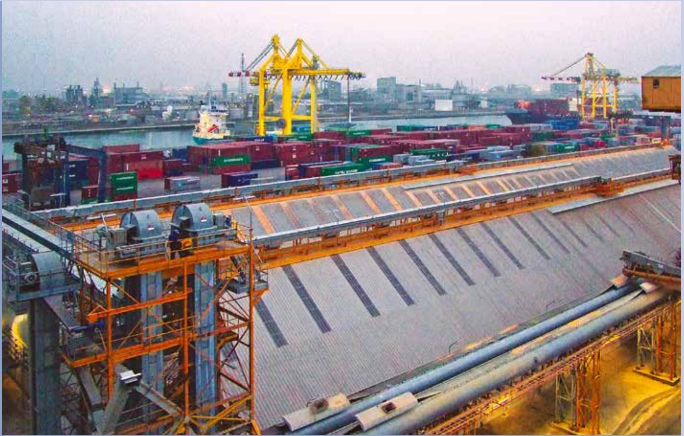
■ Ship disembarkment plant: 700 t/h