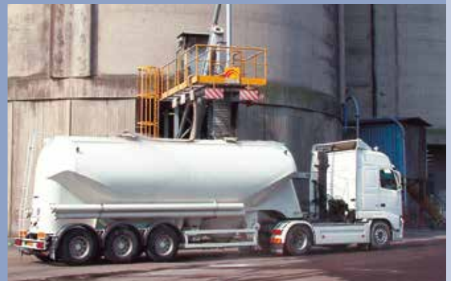
■ Transport of dusty product with weighing system