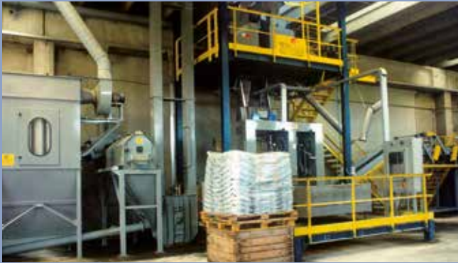
■ Bagging line