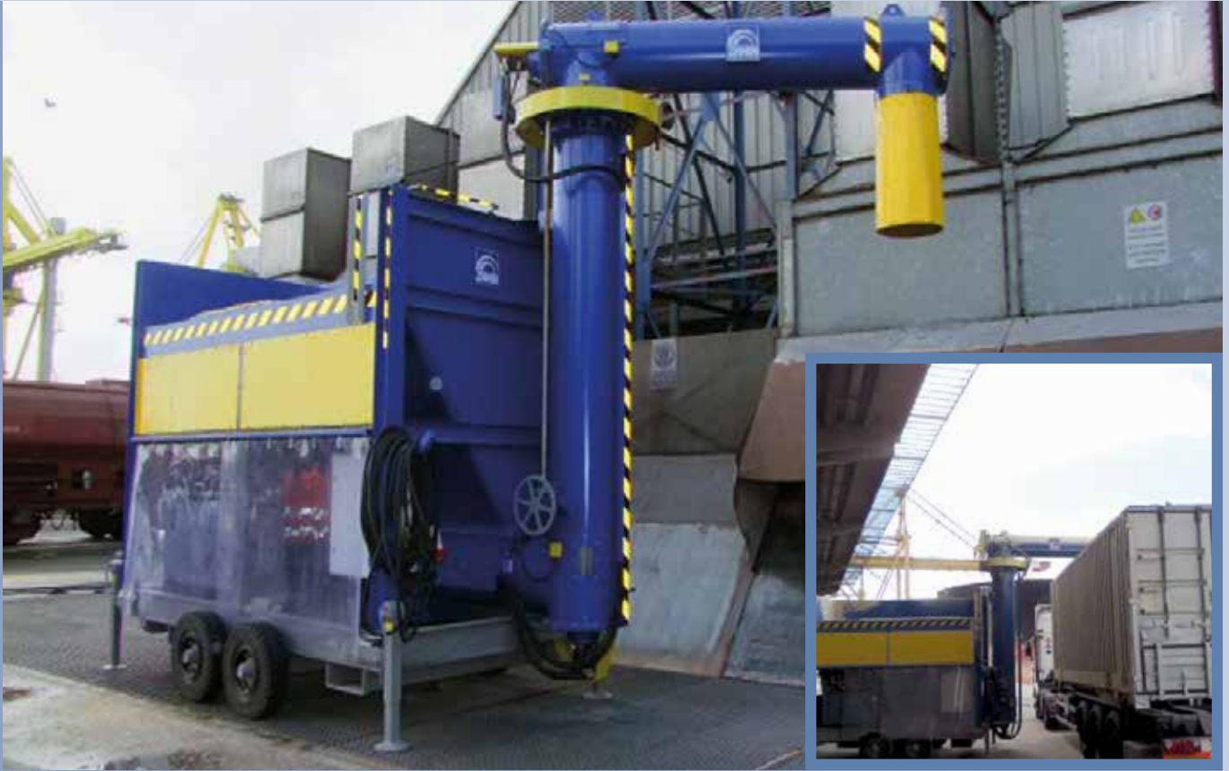
■ Drop-off with mechanized load shovel onto tanker truck or wagon