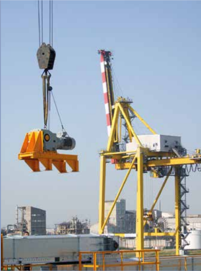
■ Carriers motorization