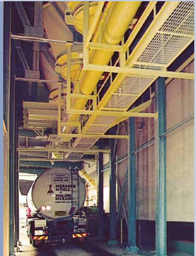
■ Quick loading with product mixing