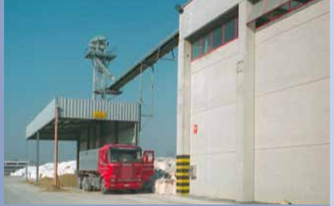
■ Bulk unloading from truck