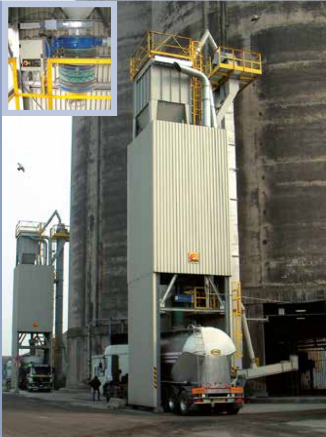
■ Ash-concrete reloading plant