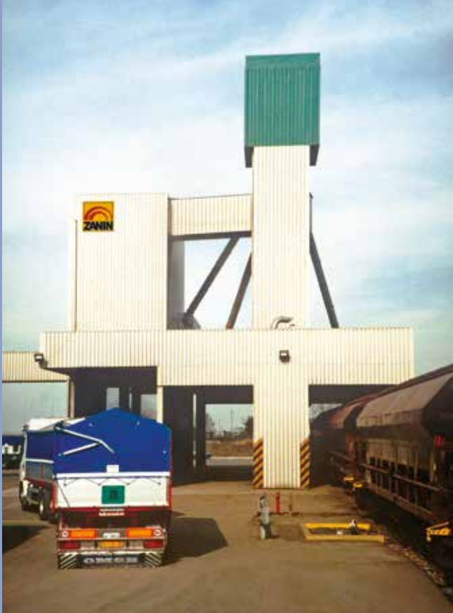
■ Receiving plant with quick load and conveyor to send to storage