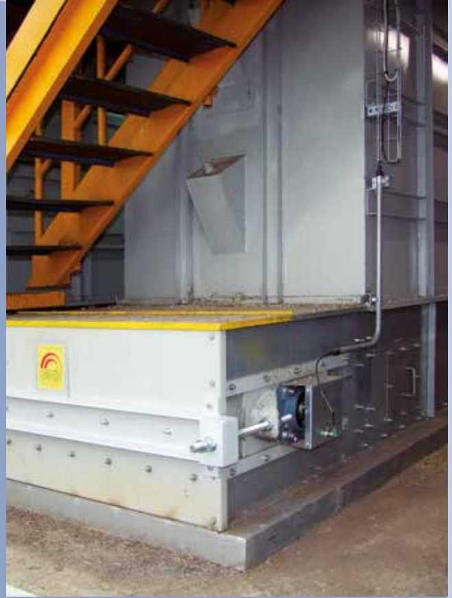
■ Weighing system with continuous discharge conveyors