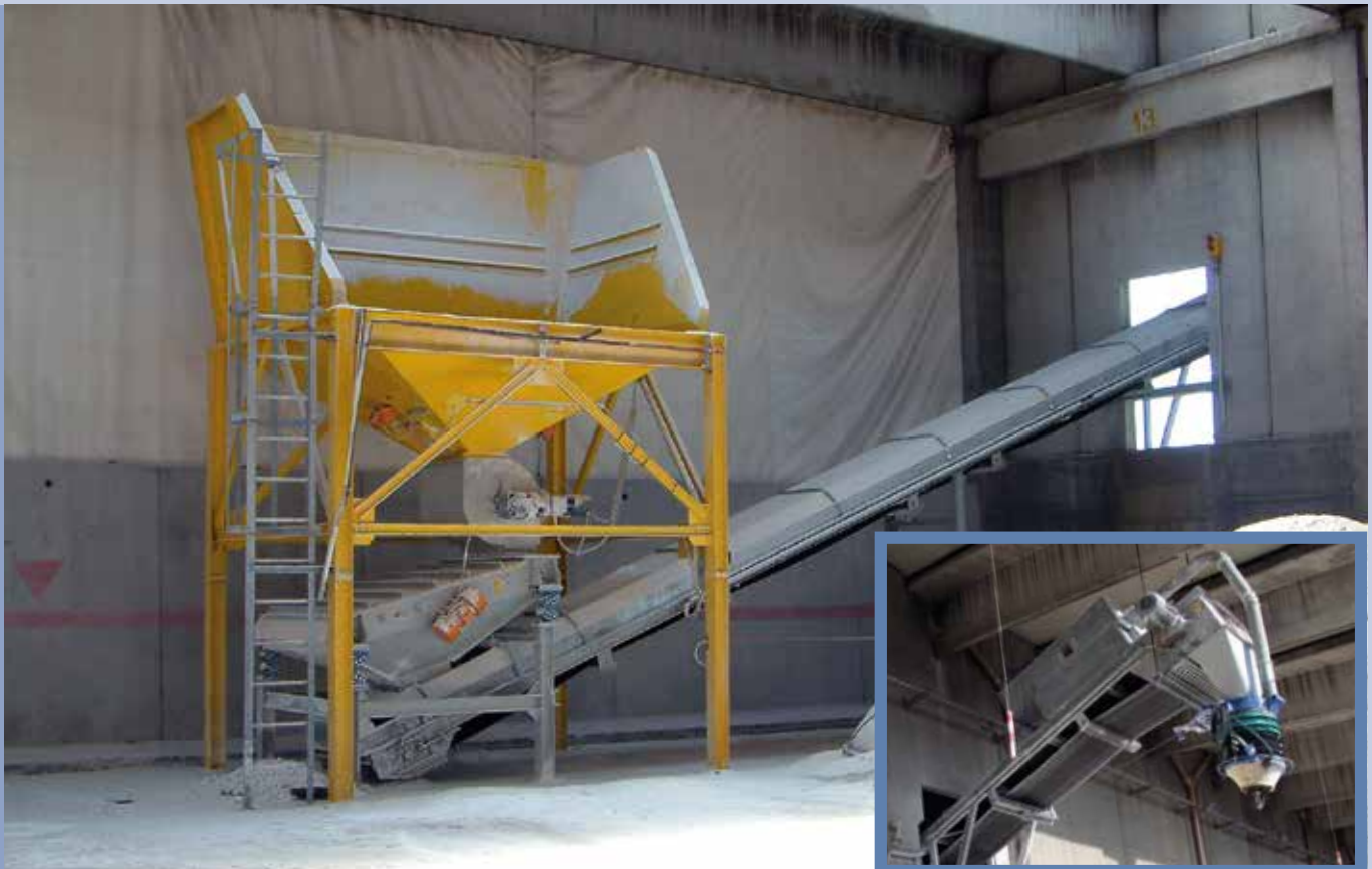
■ Drop-off products on trucks, with sieving