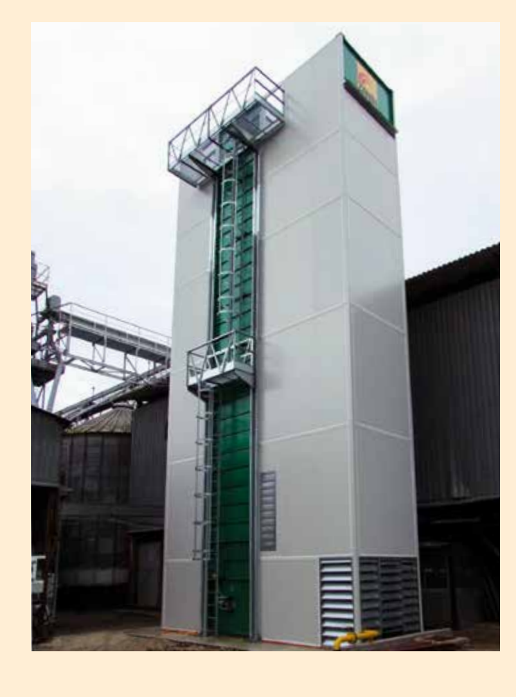
DRYING PLANT RA SERIES

The dryer has electronic equipment with process management. Electronic system for moisture management of product with air meter.