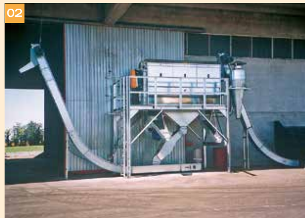
01 - Application with aspiration and cyclone 02 - Application with aspiration